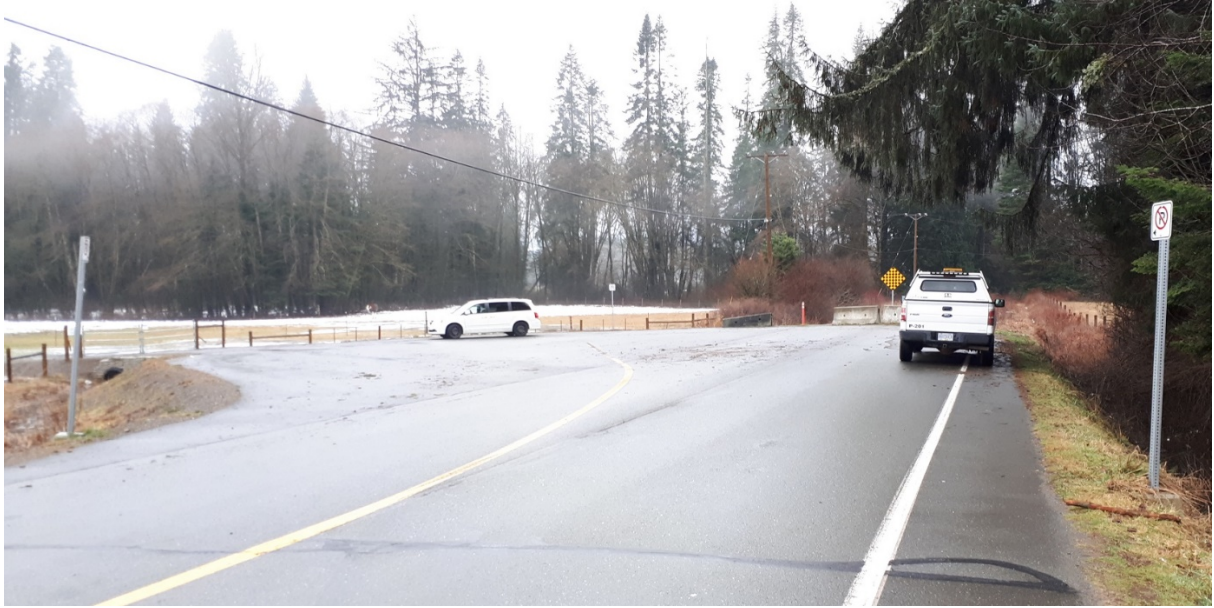
Area at end of Dove Creek Place where parking is prohibited